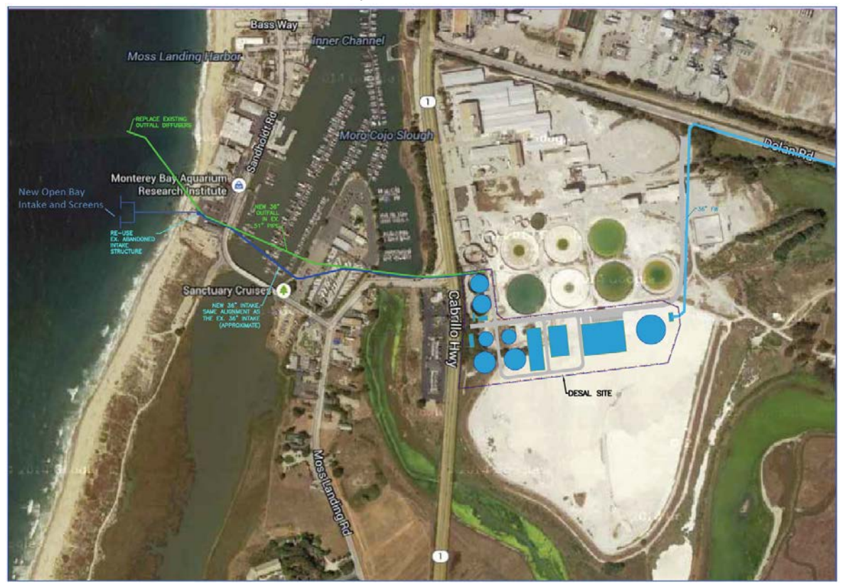
Figure 1: Location of Proposed People's Moss Landing Desalination Plant, Intake, and Outfall Locations

Where feasible, mitigation measures will be proposed to avoid or reduce any identified environmental impacts attributable to the project.