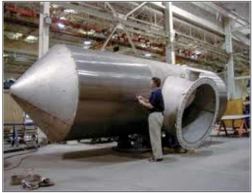
Figure 2. Examples of Wedgewire Screens for Seawater Intake